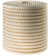
CJC™ Filter Insert - the ORIGINAL and most efficient!

The cleanliness level achieved by CJC™ Oil Filters means that the predicted lifetime of machine components and oil is expected to be extended by a factor of 2-10.